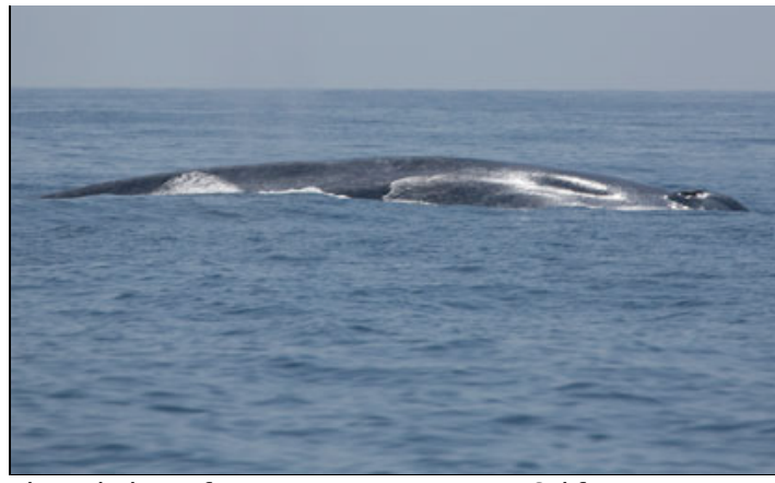
Blue whale surfacing near Point Dume, California